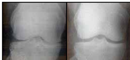
X-ray showing cartilage degeneration (left) and regeneration (right) using PEMF therapy.

is stimulated causing fractured bones to heal properly. On the X-ray on the left, the distance between the bones is almost non-existent. After PEMF treatment, the X-ray on the right shows the distance between the bones has increased dramatically, the result of new cartilage generation between the bones. The outcome has been pain free walking for this 70-year-old female patient.