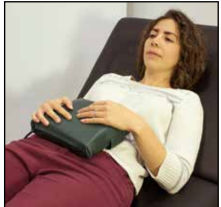
Very High Energy Coil for concentrated treatment of specific areas.